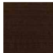
Mocha Cherry (MR) Bundles (MC) SKUs