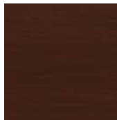
Harvest Cherry (CS)

Use below finish codes where XX is indicated in SKU #