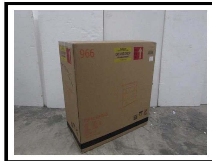
COVER PICTURE #10