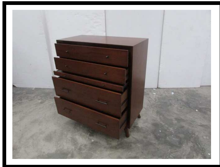
COVER PICTURE #02