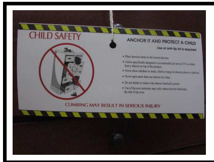
COVER PICTURE #04