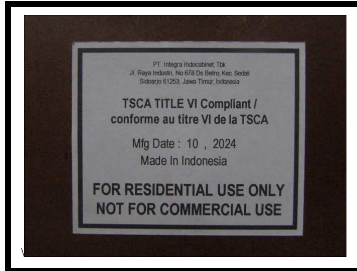
COVER PICTURE 05