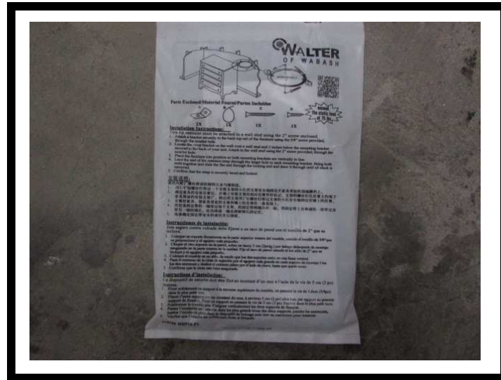
COVER PICTURE #9