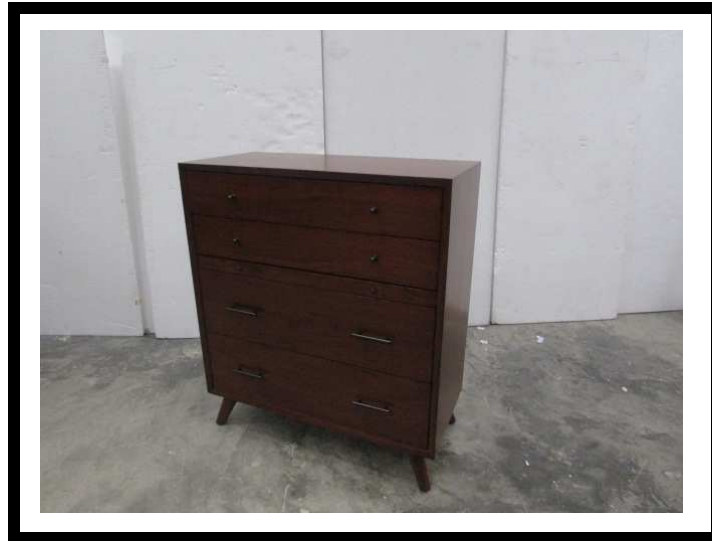
COVER PICTURE #01