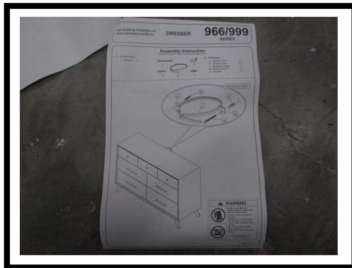
COVER PICTURE #08