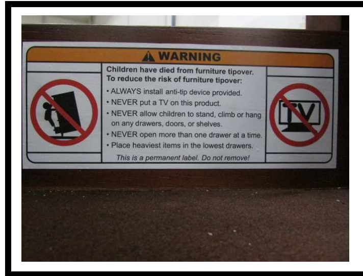
COVER PICTURE #03