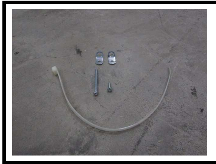
COVER PICTURE #07