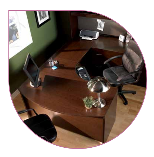
Durable Work Surfaces