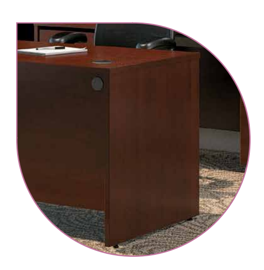
Attractive and professional closed leg design