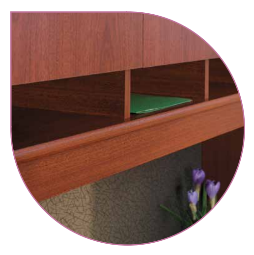
Open storage and tackboards organize active projects