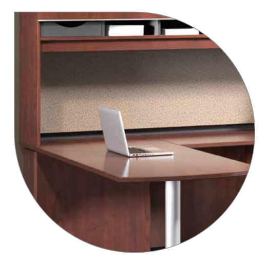
Durable thermally fused work surfaces