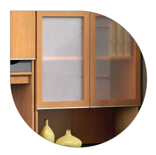
Frosted glass and extruded aluminum pulls