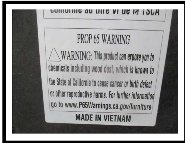
CA PROP 65 LABEL