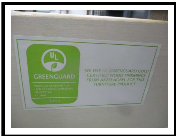
GREEN GUARD LABEL